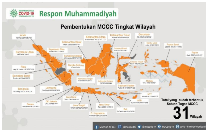
Figure 1. Muhammadiyah Responses, Source: https://covid19.muhammadiyah.id/tentang-kami/ , Access 20 th October 2020

In the implementation of the work carried out, MCCC does not go alone, MCCC consists of the following elements: the Public Health Advisory Council (MPKU); Muhammadiyah Disaster Management Center (MDMC); 'Aisiyah; LAZISMU; Council of Higher Education and Research Development (DIK'TI LITBANG); Elementary and Secondary Education Council (DIKDASMEN); Tabligh Council; Muhammadiyah Student Association (IPM); Muhammadiyah Student Association (IMM); Nasyiatul 'Aisiyah (NA); Hizbul Wathan (HW); Tapak Suci Putera Muhammadiyah (TSPM), as well as; Muhammadiyah Youth. This synergy from the central, regional, regional, branch to branch levels confirms that the MCCC's position is very ready and authoritative in tackling the spread of Covid-19 to the grassroots (MCCC, 2020b).