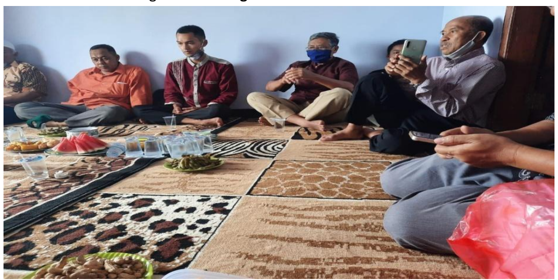
Figure 3. Mentoring Process Preparation of SJH

Mentoring process done offline or direct to all UKMs that joined the PCM Lawang Economic and Entrepreneurship Assembly located in the Purwosari area. Mentoring done with confirm procedure arrangement, pattern filling and anticipation the difficulties that arise in the process of being drafted System Halal Guarantee in independent. Documentation implementation mentoring can see in Figure 3.