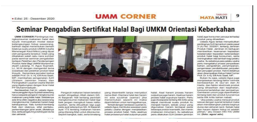
Figure 2. Socialization through Print Media

Socialization carried out discuss halal products in Islamic views and discussion Compilation System Halal Guarantee.