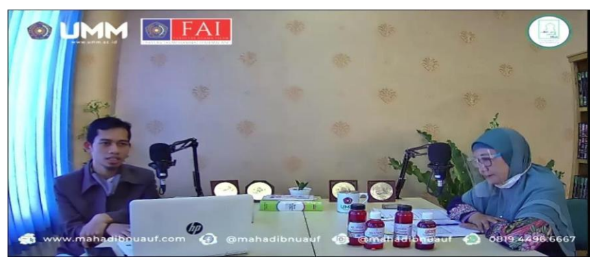
Figure 1. Socialization Via Youtube Channel

In general, consumption halal food is not only religious obligations, but also related with health, morality and blessings life. Halal products support welfare physical and spiritual, as well as reflect ethics and responsibility answer in doing business [12]. The blessings that result from consume halal products impact on life individuals, families, communities, and environment social and economic in a wider way. Socialization or counseling done to inhabitant association related understanding about halal-thayyib, safe -halal products and the preparation of the SJH Manual online through zoom channels, youtube and online and offline mass media.