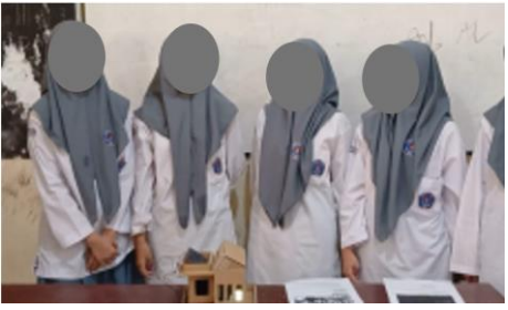
Figure 9. Group presentation

4 The activity begins by giving time to finalize the work of automatic garden lights and prepare for the presentation of the work. Then, each group will make a presentation and be assessed and given joint input by peers and the research team. Then, each group will redesign based on the input that has been given. This activity ends by giving rewards to teams that present them attractively and follow the criteria to be achieved (Figure 9).