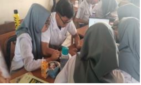
Figure 6. Problem identifying