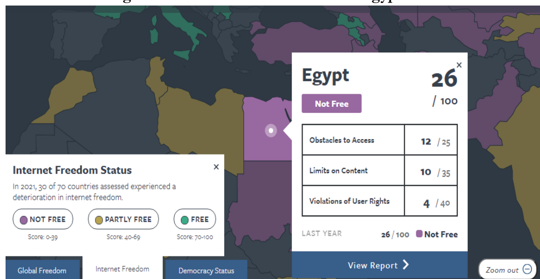
Figure 1: Internet Freedom Status in Egypt in 2020